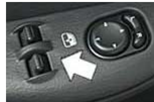
SAFER Lever switches have to be pulled up to raise a car window.