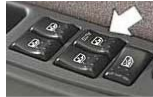
RISKY DESIGNS Horizontal rocker switches (above) and toggle switches (below).

Lever switches, the safer type. Acura, Audi, BMW, Chrysler Pacifica, Honda, Hyundai, Infiniti, most Isuzu models, Jaguar, Kia, Lexus, most Mazda models, Mercedes-Benz, Mitsubishi, Nissan, Saturn L and Vue, current Saab models, Subaru, Toyota, Volkswagen, and Volvo.